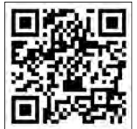
CK Retirement Resort