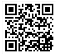
The Grocery Getters