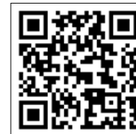
Galaxy Medical Alert