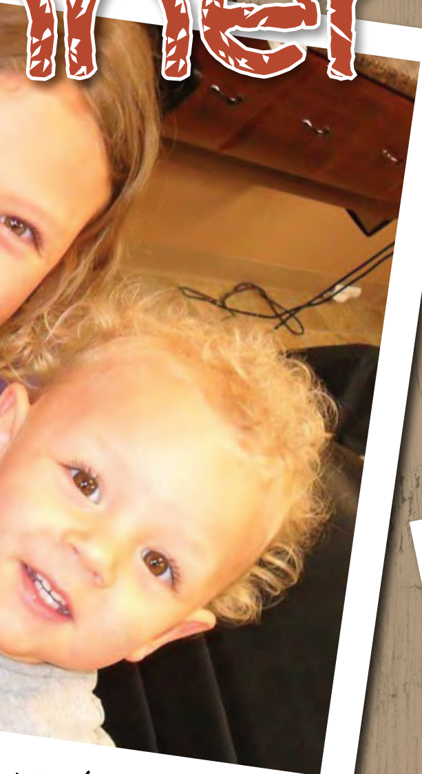
wards ards (proud Grandpa)