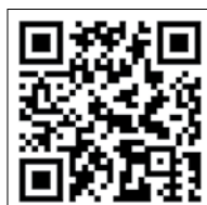
Tom & Al's