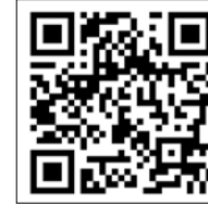
Canadian Hearing Institute