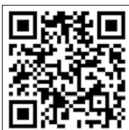
Zandberg Foot Clinic