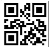
Erie St. Clair