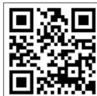
Mayes Law Firm